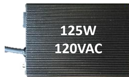
Outpost™ C125-12 Inverter

Simple No buttons - just connect & charge! LEDs provide system state, solar input, & fault indications