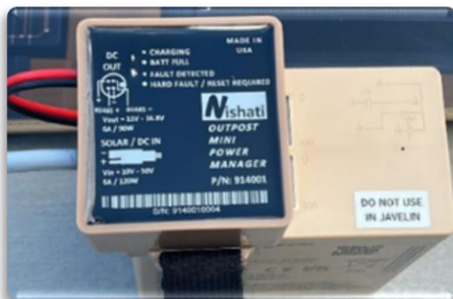
Outpost™ Mini Power Manager

Power and Charge Radios, Sensors, End-user Devices, Batteries